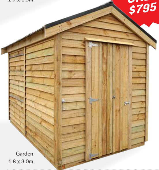
Garden 1.8 x 3.0m

In Stock sheds roof colour is Ironsand. All prices shown include GST.