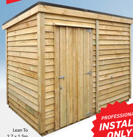
Lean To 2.7 x 1.5m